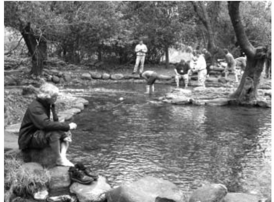
Headwaters of the Jordan

Twenty mid-career pastors made a 12-day pilgrimage to the Holy Land in January, and another 20 in May. Their "journey of faith" was made possible by a grant from the Holy Land Institute of the CF Foundation. Here, pilgrims explore the North Church at Avdat, in the Negev desert. It is one of two churches built during the Byzantine period by the Nabateans, desert traders who converted to Christianity following Constantine's conversion in the 4th century.