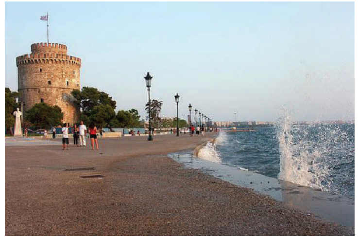
White tower of Thessaloniki

We will be taken to the Athens airport for our flight to New York and our connecting flights home. We leave one another with shared memories and blessings.