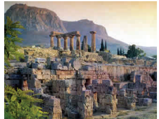
Temple of Apollo in Corinth