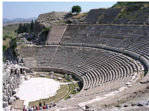
Roman theatre of Ephesus