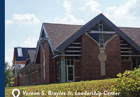
Vernon S. Broyles Jr. Leadership Center