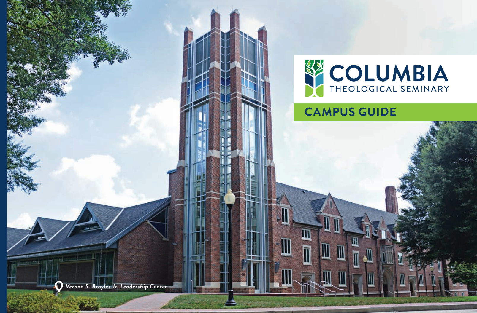
Vernon S. Broyles Jr. Leadership Center

These areas are used by students and community members as a site for worship, play, gardening, and rest.