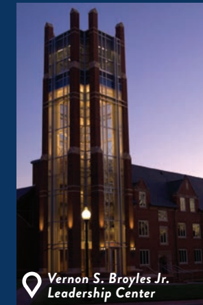
Vernon S. Broyles Jr. Leadership Center

* Leadership in Energy and Environmental Design (LEED) Green Building Rating System™ is the nationally accepted benchmark for the design, construction, and operation of high performance green buildings.