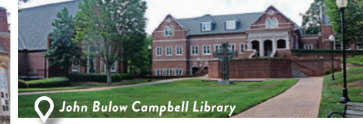
John Bulow Campbell Library

The library provides access to thousands of theological and academic resources both electronic and in print. In the library, you can discover the seminary archives, local church histories, the children’s library, and the Center for Academic Literacy.