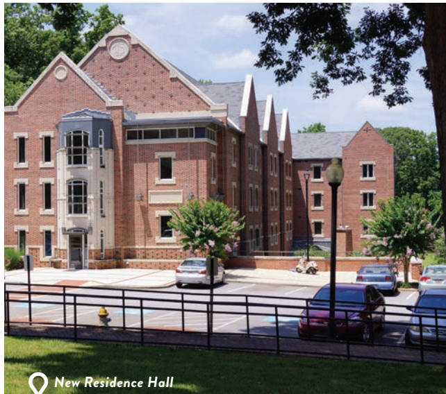
New Residence Hall