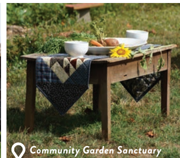
Community Garden Sanctuary